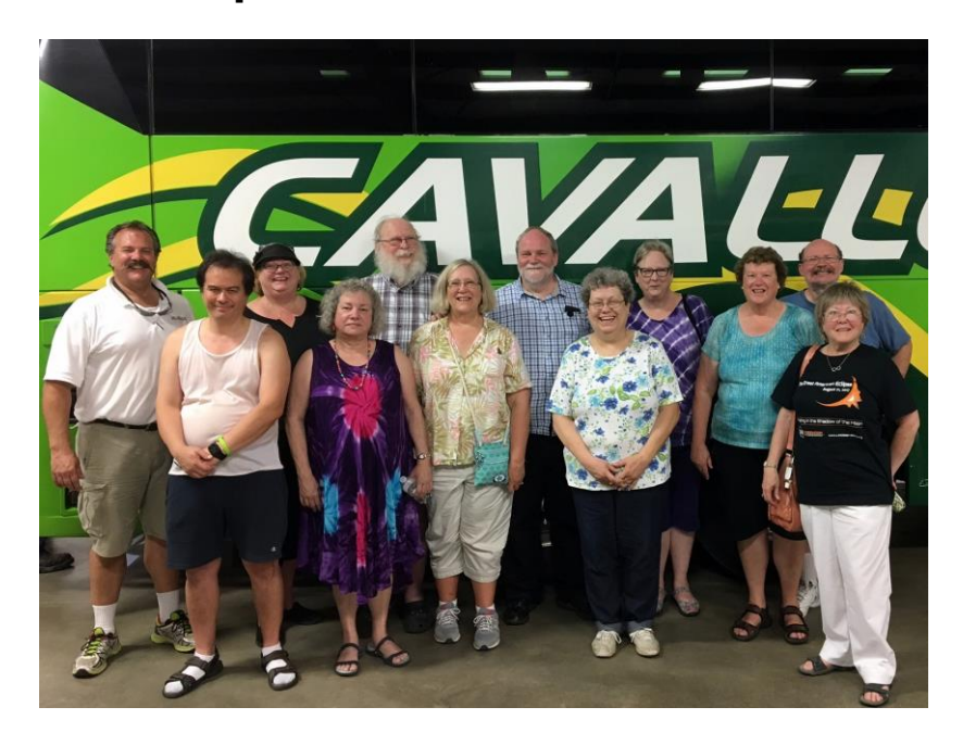
On August 21, twelve Mensans traveled by bus to Princeton, Kentucky, to view The Great American Eclipse. This trip was arranged through the Link Observatory. Here is a picture and some comments: