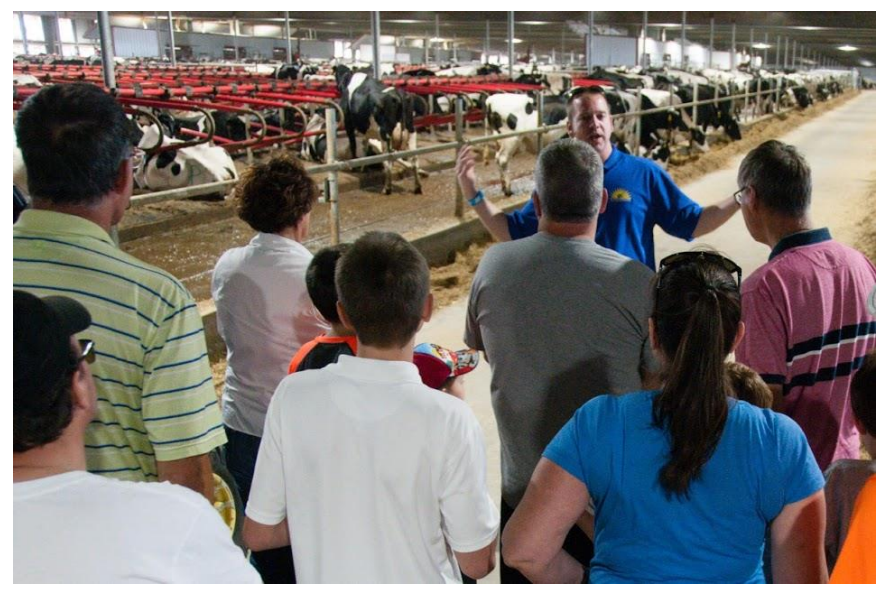
This year, some of the Blasters visited a local dairy farm.