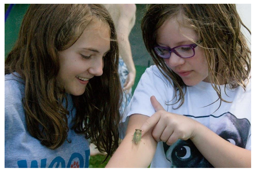
Two Blasters meet one of the "locals."