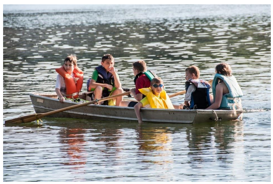
Safety First! Everyone wears a life jacket on the water.