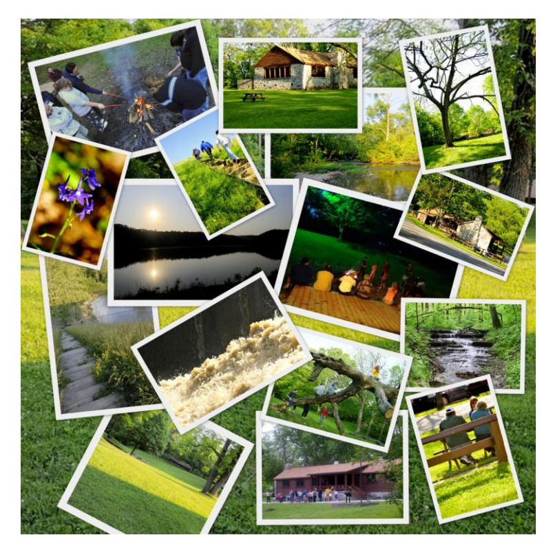
OMG! Outdoor Mensa Gathering! May 15-17, 2015 Versailles State Park, Indiana