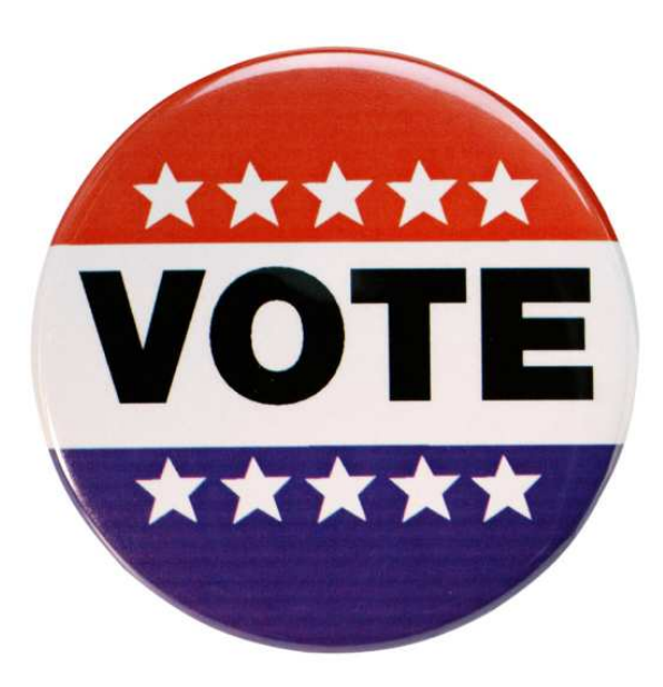
Meet Your Fx-Com Candidates