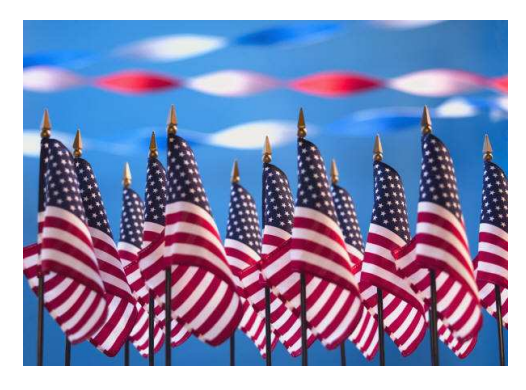
Happy July 4th