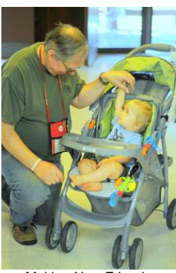
Making New Friends