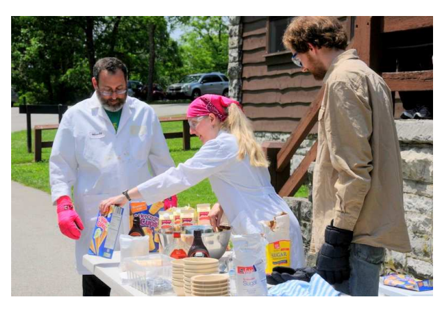
Making Liquid Nitrogen Ice Cream At the May 2012 Outdoor Gathering