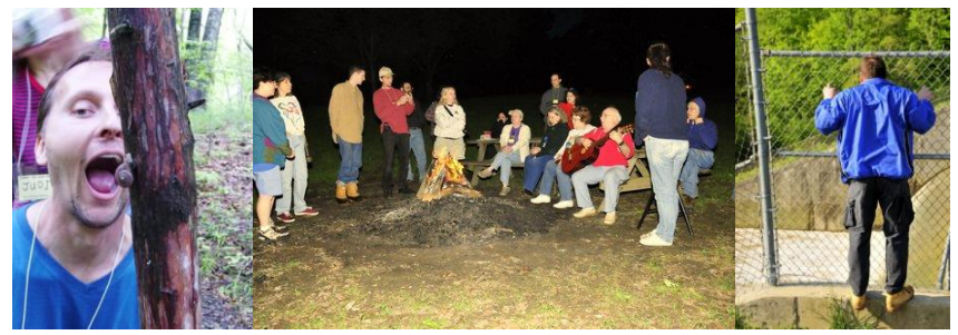
Plenty of food, and fun around the campfire! There's no escaping a good time!

Mark your calendars for the weekend of May 16-18, 2014 and shake the mothballs out of your old sleeping bag,. Central Indiana Mensa's Outdoor Gathering is next month. Once again, it's in beautiful Versailles State Park in southeastern Indiana. We have the group camp all to ourselves with dorm-style cabins and a wonderful lodge for meals and socializing.