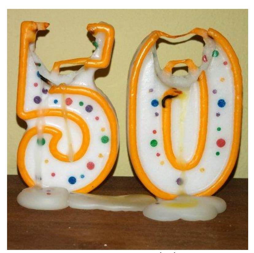
AS TIME MELTS AWAY...