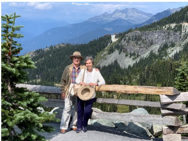
image was taken at the top of the mountain where the 2010 Winter Olympics were held. We both agree that this was the best vacation that we had taken together.

The first image was taken on August 3, 2019, at Whistler, British Columbia. My girlfriend and I had decided to take ten-day vacation in Canada with Rocky Mountaineer. We traveled from Vancouver, British Columbia to Calgary, Alberta. This