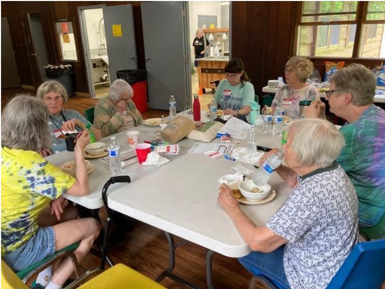
Friends Gather at OMG! for the First Time in Three Years