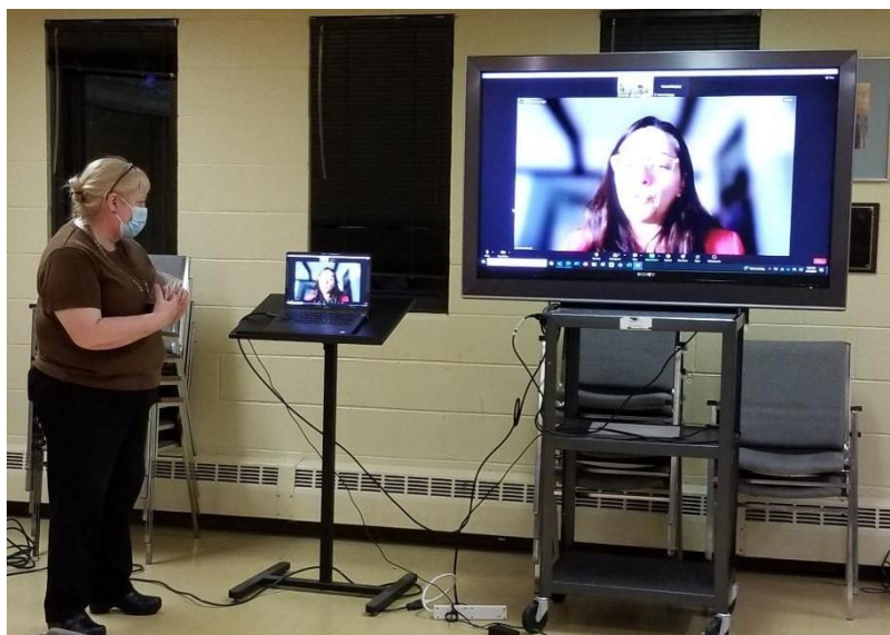
Scenes from the June Monthly Meeting, in person!